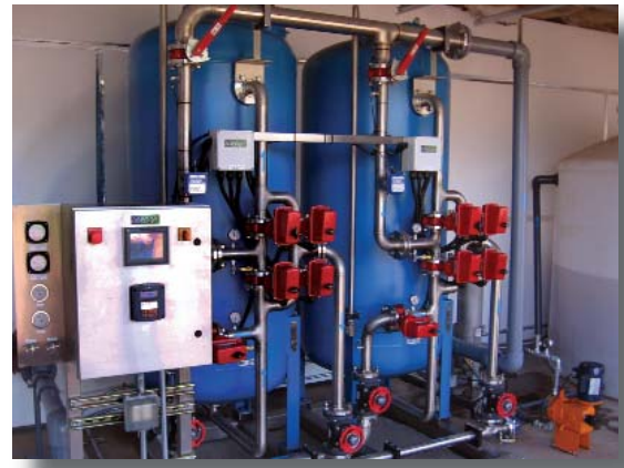
AdEdge APU System featuring AD92 IX Media

AD92 is ideal for use in potable water as well as non-potable and environmental remediation applications for removal of naturally occurring uranium. The high efficiency AD92 can selectively remove the negatively charged uranium anion (most often in the form of uranyl carbonate) to below the existing EPA MCL of 30 ug/L. The AdEdge AD92 systems can deliver the needed performance in two ways: (1) via regeneration type systems which use the media to remove the uranium with periodic regeneration using NaCl brine; or (2) as a "throw away" discardable media, which can be discarded when spent. This option maximizes the very high capacity of the AD92 media. Where on-site regeneration is not available, this disposal option is the preferred option. Disposal options will vary based on federal, state, and local regulations.